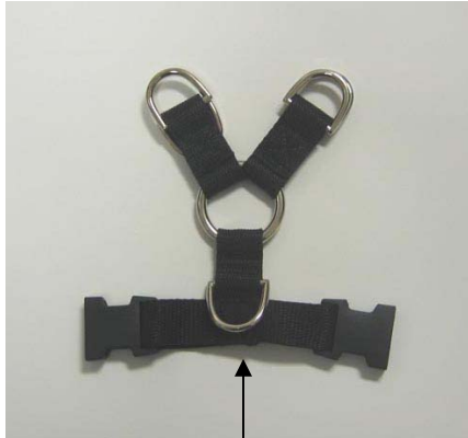
Center metal cinch ring