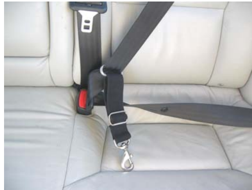
Restraint attached to diagonal portion of seat belt

Cleaning: Promptly wipe up any foreign matter or liquid with a damp cloth or sponge. The safety vest is machine washable in cold water. Before washing, remove the “yoke” section (see above) by removing the upper straps from the metal “D” rings, and disconnecting the plastic quick-release buckles from the lower straps. The “yoke” section should not go in the washing machine.